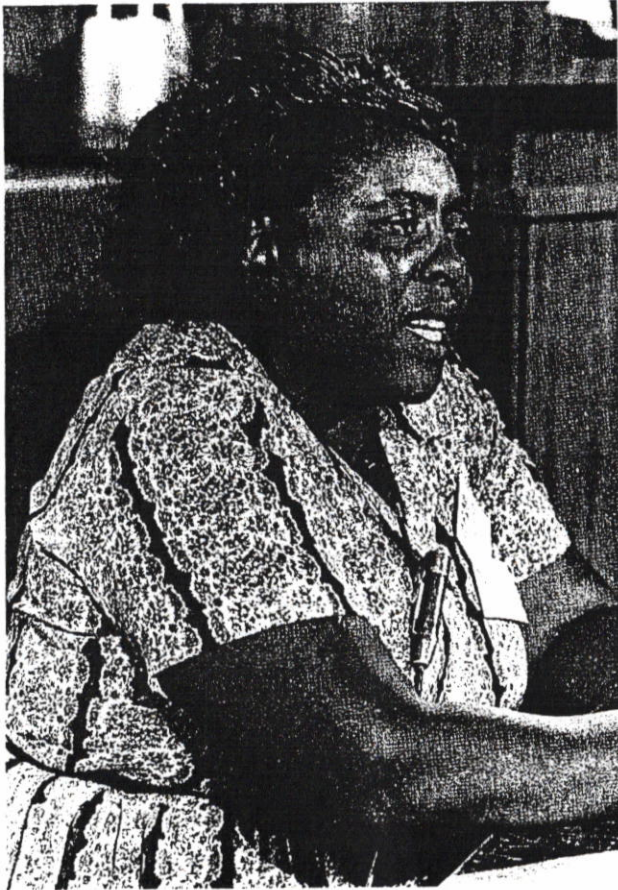
Fannie Lou Hamer.

against the evils and inhumanity of Capitalism while at the same time negate, in our actions, those most affected by capitalism.